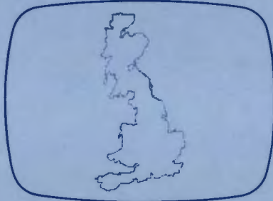
USING GRAFPAD FOR TRACING