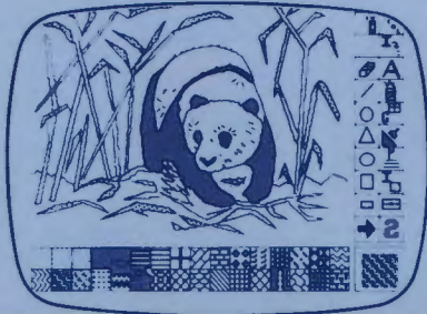
FREE-HAND DRAWING ICON SOFTWARE